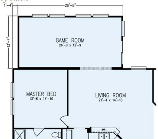
GAME ROOM TAG OPT