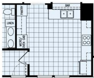
ULTIMATE KITCHEN OPT