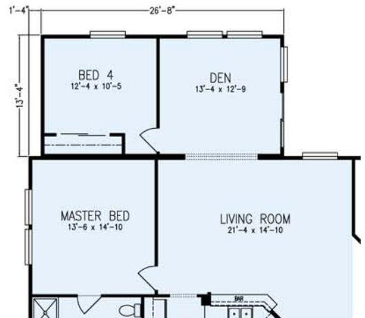
4TH BED DEN TAG OPT